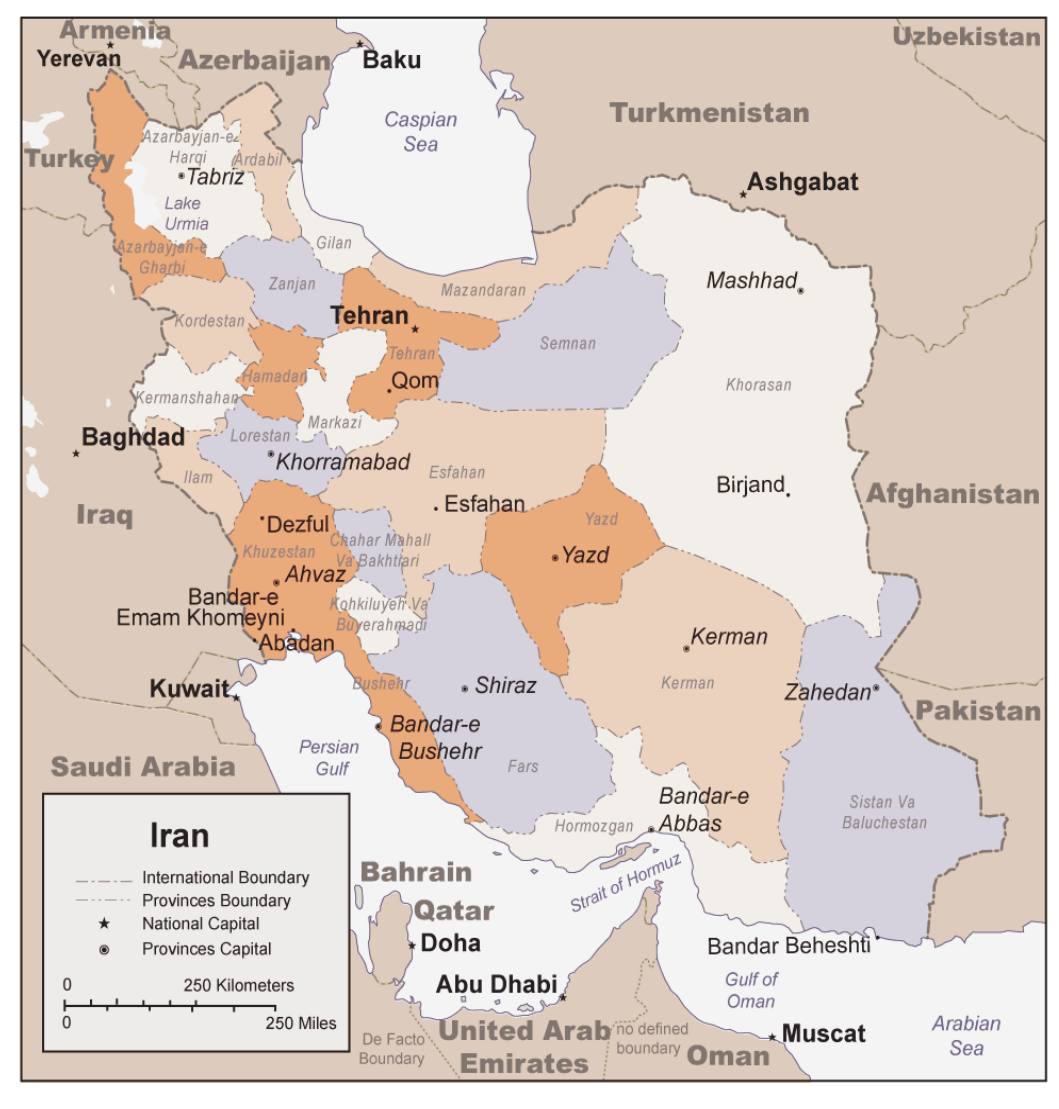
Figure 2. Map of Iran