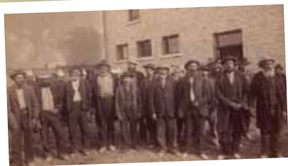
Indigenous Métis men taken prisoner during rebellion against Canada, 1885