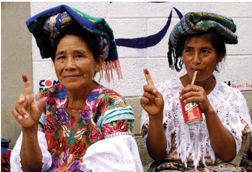
K'iche'maya women show inked fingers after voting in Guatemala