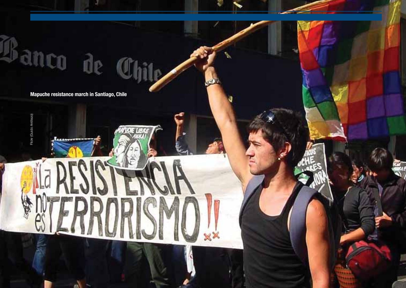
Mapuche resistance march in Santiago, Chile