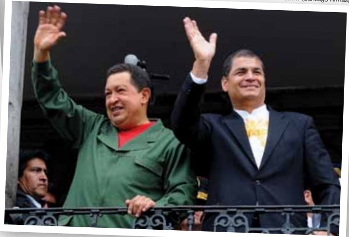
Presidents Hugo Chávez of Venezuela and Rafael Correa of Ecuador greet crowds in Quito