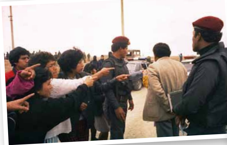
Residents of Villa el Salvador, Peru, point to suspected member of Sendero Luminoso, September 1992