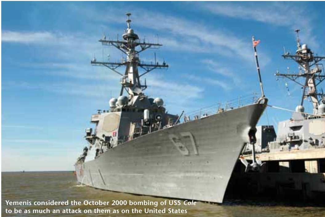
Yemenis considered the October 2000 bombing of USS Cole to be as much an attack on them as on the United States

Agency for International Development (USAID) personnel, no Peace Corps, and no offer of scholarships. The Yemeni decision to vote against the 1990 United Nations Security Council Resolution on Operation Desert Shield/Desert Storm and the 1994 civil war are often cited as the reasons for this precipitous drop. However, Yemen was not alone among Arab states in opposing non-Arab military action to liberate Kuwait—Jordan and Tunisia took the same position—and the civil war lasted barely 2 months. It hardly represented a significant, direct, or continuous threat to U.S. personnel. Yemen just slipped quietly off our radar screen. There was no major economic interest and no apparent security interest. It was neither malicious nor benign neglect—just indifference.