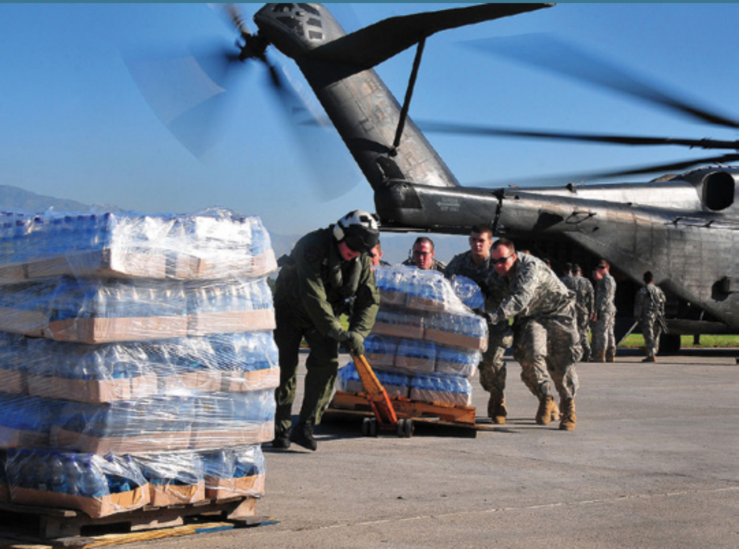
U.S. Army soldiers help the crew of a U.S. Navy MH-53E Sea Dragon helicopter from the aircraft carrier USS Carl Vinson unload food and supplies at the airport in Port-au-Prince, Haiti.