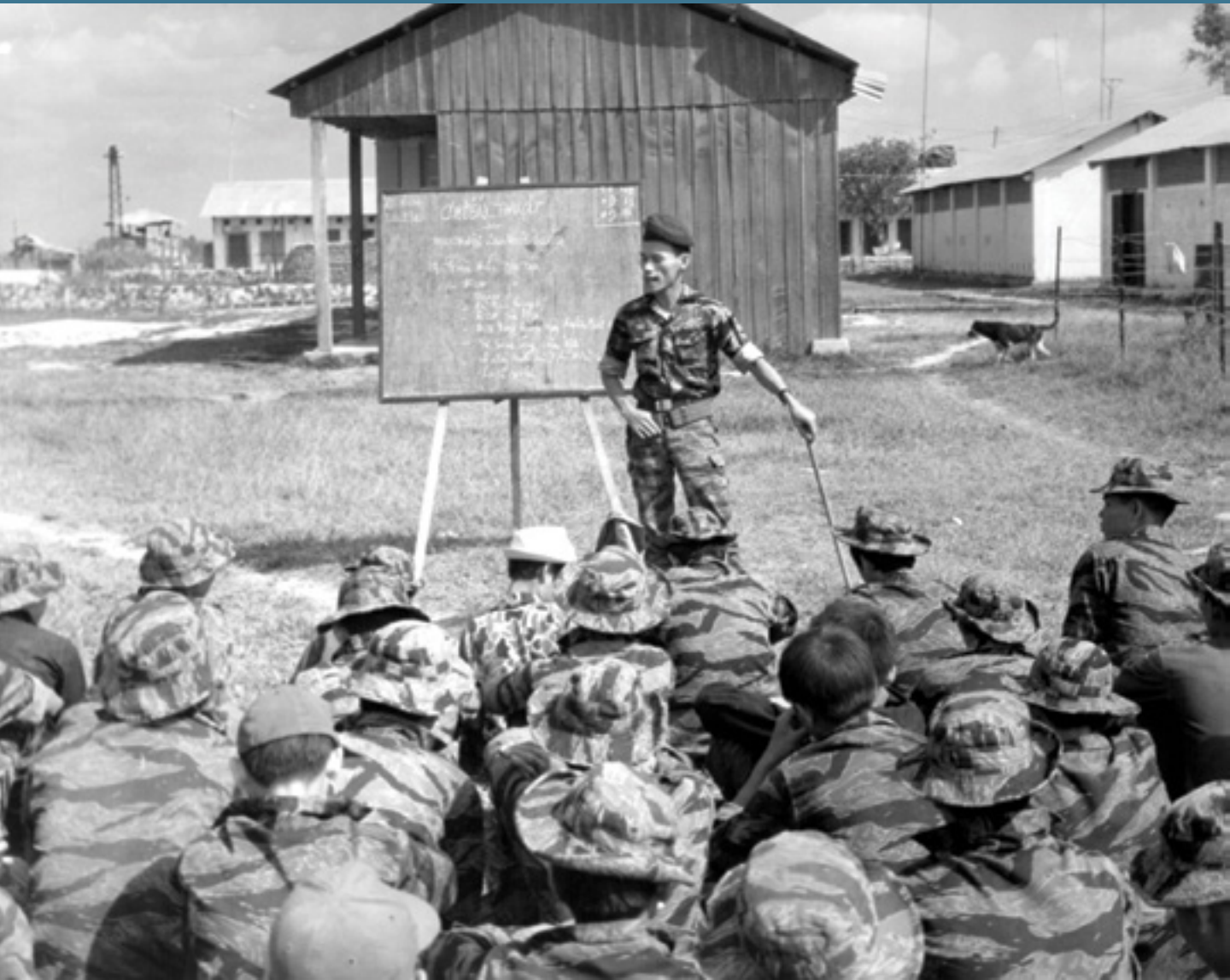
Civilian Irregular Defense Group (CIDG) Training in Vietnam.