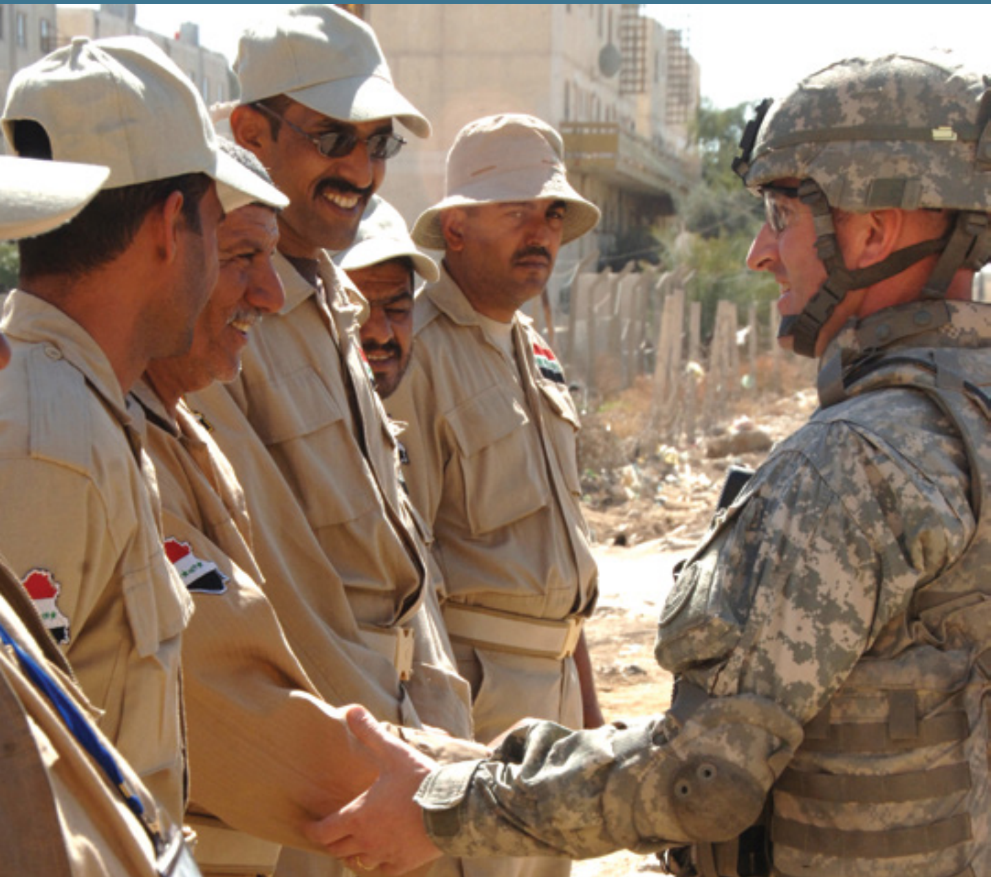
U.S. Army Lt. Col. Myran Reineke congratulates members of Sons of Iraq during the establishment of a new checkpoint for the group in the Rashid district of Baghdad, Iraq, March 6, 2008.