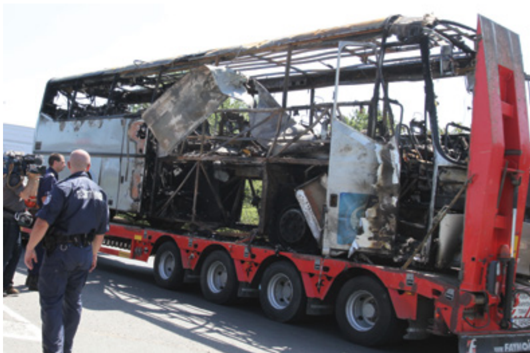
Security staff look at one of the damaged buses carrying Israeli tourists that was hit by a bomb explosion on July 18, 2012 at Bourgas Airport in Bulgaria. Hezbollah was blamed for the attack.

the frontiers of Argentina, Brazil and Paraguay. From this base in Ciudad del Este, Paraguay, Hezbollah set up illicit enterprises to fund its operations in the Middle East and elsewhere; the organization's endeavors included money laundering, counterfeiting, piracy, and drug trafficking. 11 A 2004 study for the Naval War College determined that Hezbollah's operations in the TBA generated about $10 million annually, while a 2009 Rand Corporation report said Hezbollah netted around $20 million a year. For Paraguay, the dark side of globalization, manifested through drugs, arms, and counterfeit goods smuggling, as well as the money laundering that accompanies these illicit activities, is a threat to the country's economic prosperity and security. Counterfeit goods sold in the black market, such as fake pharmaceuticals, threaten the safety and health of consumers, defraud those who researched