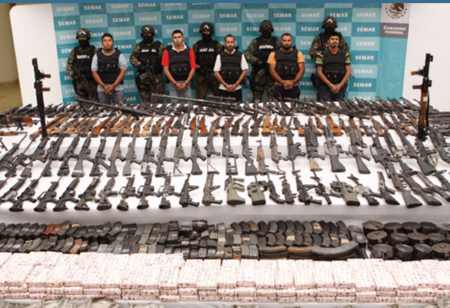
Mexican federal police display arrested Los Zetas members, confiscated drugs, weapons, and ammunition.