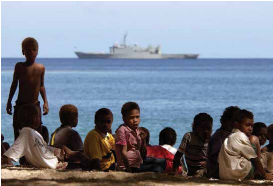
Village children gather on the beach to watch the amphibious ship HMAS Manoora anchored in Lambi Bay at the start of RAMSI

■ A deployable police capability complements the military as an instrument of national power. The Australian Government judged the AFP's contribution to RAMSI so