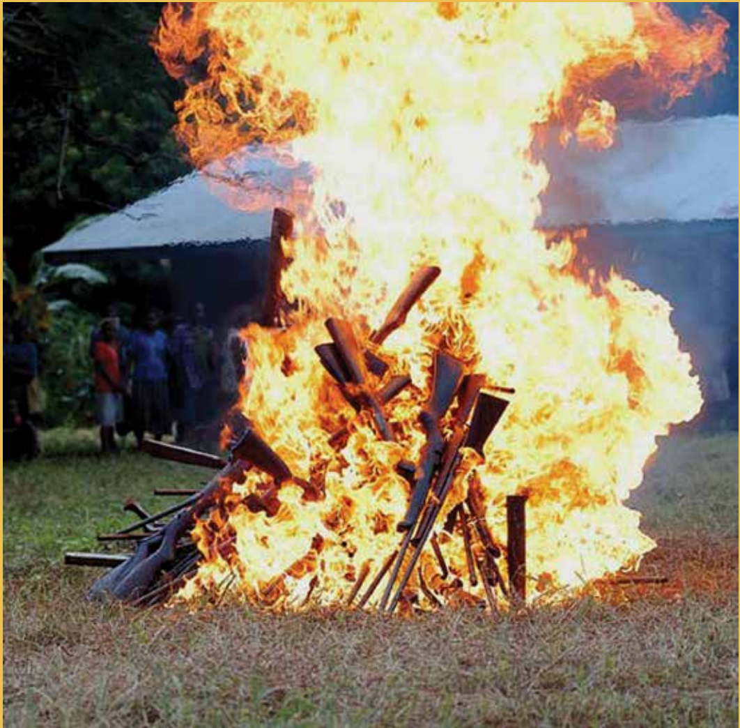
Weapons destroyed on the Weathercoast of Guadalcanal