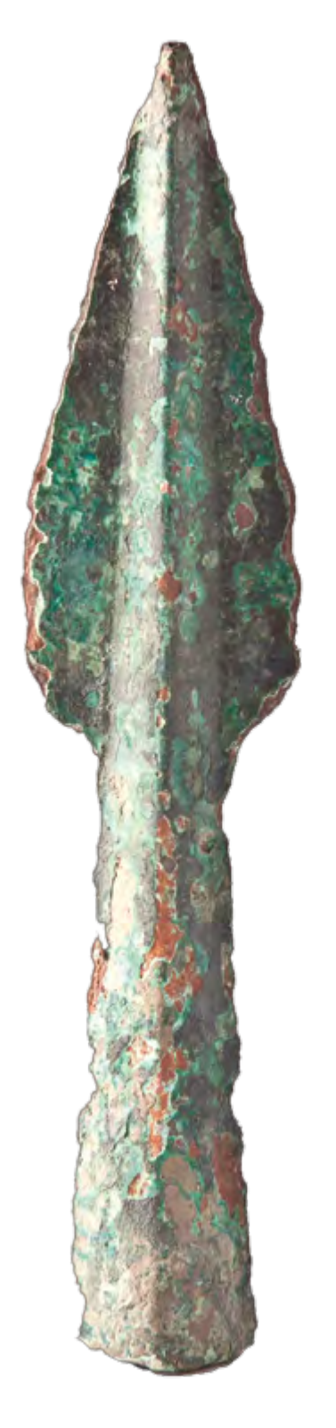
Bronze Spear Point Military success was both an enabler and an outcome of the increasing political and bureaucratic organization of early states.