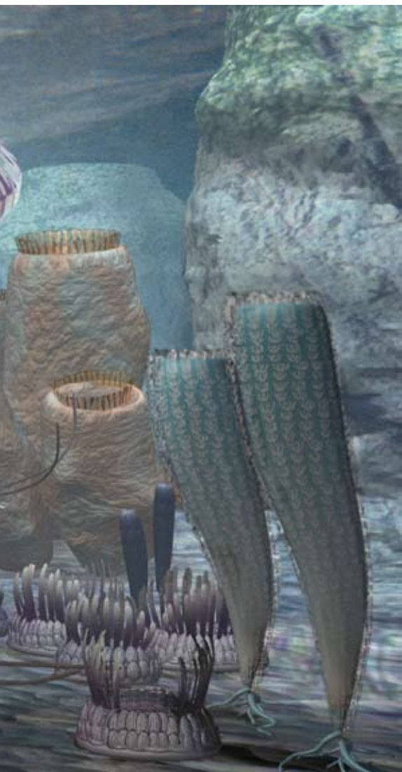
LEFT: An Anomalocaris— Anomalocaris saron —from the Chengjiang fauna in China cruises over the Cambrian seafloor in search of prey.