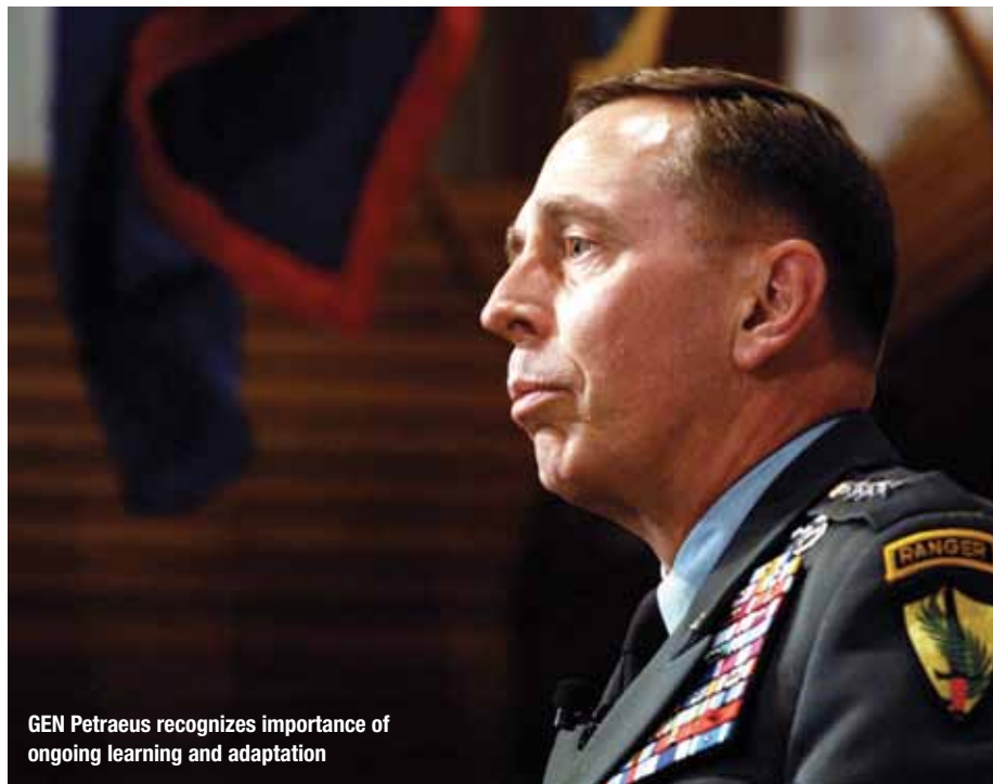
GEN Petraeus recognizes importance of ongoing learning and adaptation