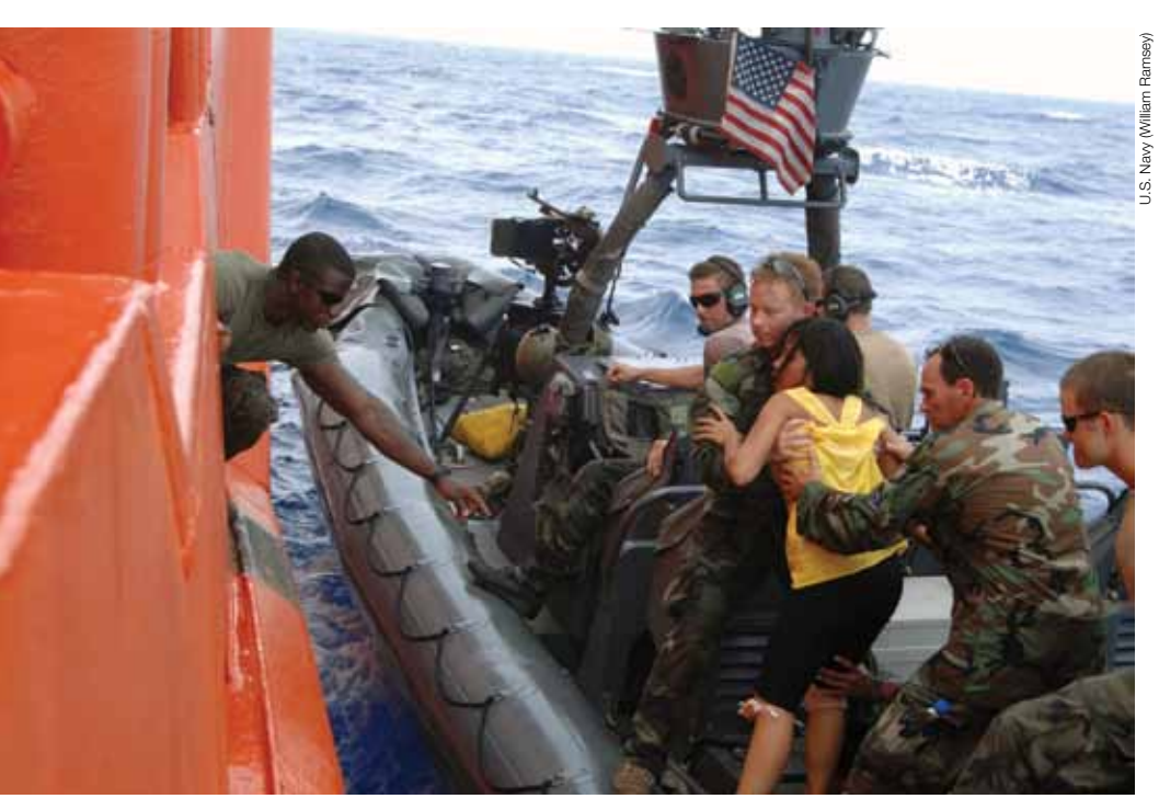
Woman injured during sinking of ferry near Zamboanga del Norte, Philippines, is helped aboard Navy vessel by members of U.S. Joint Special Operations Task Force–Philippines

JFQ: The next question centers on the 5<sup>th</sup> SOF truth: "Most special operations require non-SOF support." How do you feel about the support you are getting from the Services?