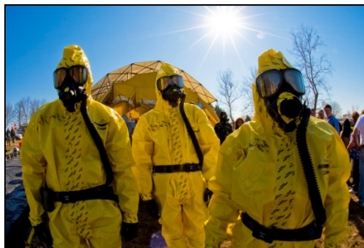
Hazardous material decontamination operators await the arrival of contaminated patients during a simulated nuclear attack during Operation Vibrant Response at Muscatatuck Urban Training Center, Butlerville, Ind., Nov. 8, 2009.

We will counter WMD proliferation as it presents a grave and common threat to our Nation and others. Working through institutions, alliances and coalitions, we will dismantle proliferation networks, interdict movement of materials, further improve nuclear forensics capabilities, and secure nuclear, chemical, and biological materials