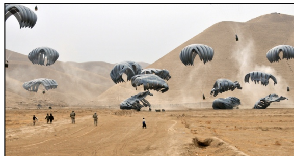
U.S. Service members retrieve cargo dropped from a U.S. Air Force C-17 Globemaster III near Forward Operating Base Todd in Afghanistan's Badghis province on Jan. 6, 2011.

capacity to extend these competitive advantages to others – our unique capabilities amplify their efforts.