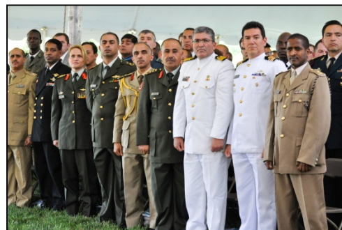
These students prepare to graduate from the College of International Security Affairs on 10 June, 2010 at National Defense University, Fort McNair, Washington D.C. Each year, over 135 countries send their military officers to study national security affairs and operational matters at our military's educational institutions.

We will adapt deterrence principles to our efforts in countering extremists. Though terrorists are very difficult to deter directly, they make cost/benefit calculations and are dependent on states and other stakeholders we are capable of influencing. When directed, we will provide capabilities to hold accountable any government or entity complicit in attacks against the United States or allies to raise the cost of their support. And we must take further steps to deny terrorists the benefits they seek through their attacks. We will, on order, be prepared to respond to any attack across the full spectrum of military capabilities with an appropriate and measured response at a time and place of our Nation's choosing.