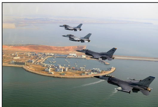
Four F-16 Fighting Falcons fly over the Piung Harbor during a U.S. and Republic of Korea Air Force Coalition flight in celebration of the 60th anniversary of the Korean War.

Asia and Pacific – The Nation's strategic priorities and interests will increasingly emanate from the Asia-Pacific region. The region's share of global wealth is growing, enabling increased military capabilities. This is causing the region's security architecture to change rapidly, creating new challenges and opportunities for our national security and leadership. Though still underpinned by the U.S. bilateral alliance system, Asia's security architecture is becoming a more complex mix of formal and informal multilateral relationships and expanded bilateral security ties among states.