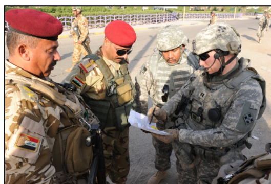
U.S. Soldiers assigned to 3rd Platoon, Charlie Company, 1st Battalion, 68th Armored Regiment, 3rd Brigade Combat Team, 4th Infantry Division provide support to the 2nd Battalion, 50th Brigade, 14th Iraqi Army Division in a cordon and search outside Joint Security Station Basra Operations Command, Iraq, July 25, 2010.