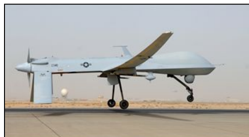
RQ-1 Predators, like the one shown here, are being deployed from Creech Air Force Base, Nev., to provide intelligence, surveillance and reconnaissance capabilities in support of relief efforts in Haiti.

In today's knowledge-based environment, the weight of operational efforts is increasingly prioritized not only by the assignment of forces, but also by the allocation of ISR capabilities. The ability to create precise, desirable effects with a smaller force and a lighter logistical footprint depends on a robust ISR architecture. Across all domains, we will improve sharing, processing, analysis, and dissemination of information to better support decision makers. We will make our command and control more survivable and resilient through redundancy, and improve human intelligence capabilities. To do so, we must change our mindset from simply increasing the density of ISR capabilities to evaluating our