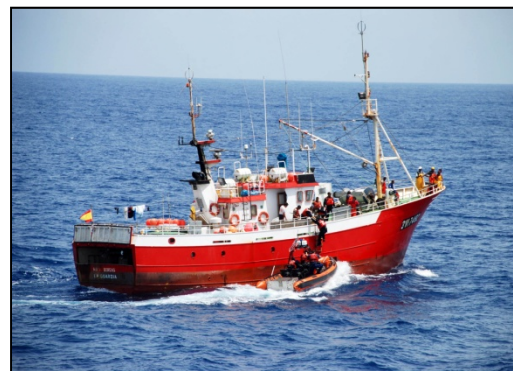
A boarding team made up of crew members from U.S. Coast Guard Cutter Legare (WMEC 912) and representatives of the Cape Verde Coast Guard and Judiciary Police approach a fishing boat during boarding operations in the Atlantic Ocean Sept. 3, 2009."

Africa – Our Nation continues to embrace effective partnerships in Africa. The United Nations and African Union play a critical role in humanitarian, peacekeeping and capacity-building efforts, which help preserve stability, facilitate resolutions to political tensions that underlie conflicts, and foster broader development. To support this, the Joint Force will continue to build partner capacity in Africa, focusing on critical states where the threat of terrorism could pose a threat to our homeland and interests. We will continue to counter violent extremism in the Horn of Africa, particularly Somalia and the Trans-Sahel. We will work in other areas to help reduce the security threat to innocent civilians. We must identify and encourage states and regional organizations that have demonstrated a leadership role to continue to contribute to Africa's security. We will help facilitate the African Union's and the Regional Economic Communities' development of their military capacity, including the African Stand-by Force, to address the continent's many security challenges.