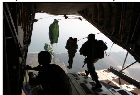
A Royal Thai Marine Corps reconnaissance team conducts jump training with Marines assigned to Force Reconnaissance Company, 3rd Reconnaissance Battalion during exercise Cobra Gold 2011 at U-Tapao Royal Thai Navy Airfield, Chanthaburi province, Thailand, Jan. 21, 2011.

As military capability and capacity increases in Asia, we will seek new ways to catalyze greater regional security cooperation. Leveraging our convening power, we will expand the scope and participation of multilateral exercises across the region. We seek expanded military cooperation with India on nonproliferation, safeguarding the global commons, countering terrorism, and elsewhere. We will expand our military