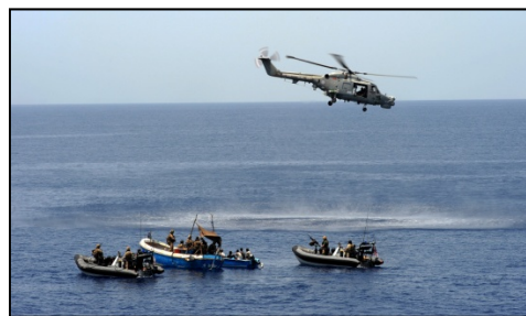
While conducting counterpiracy operations in the Gulf of Aden as part of Combined Maritime Forces (CMF) Task Force 151, the Royal Navy Type 23 Frigate HMS Portland (F 79) detected, intercepted and boarded two suspicious skiffs preventing a possible pirate attack.

Transnational Challenges – In combination with U.S. diplomatic and development efforts, we will leverage our convening power to foster regional and international cooperation in addressing transnational security challenges. Response to natural disasters and transnational threats such as trafficking, piracy, proliferation of WMD, terrorism, cyber-aggression, and pandemics are often best addressed through cooperative security approaches that create mutually beneficial outcomes. Working to address these threats provides a rough but adaptable agenda. Combatant Commanders can tailor to their region and coordinate across regional seams.