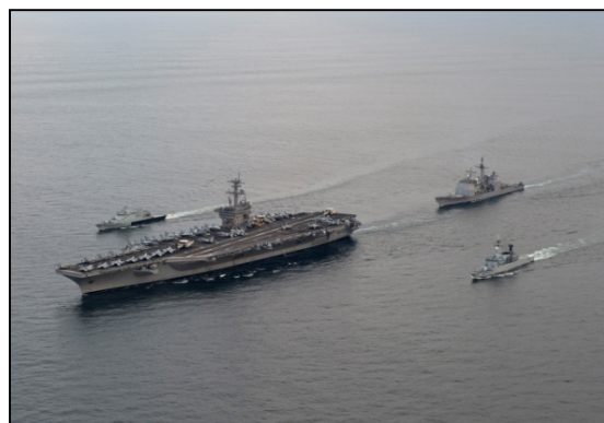
The Nimitz-class aircraft carrier USS Carl Vinson (CVN 70) leads the Royal Malaysian Navy frigate KD Lekir (FF 26) and corvette KD Kelantan (FFL 175) and the Ticonderoga-class guided-missile cruiser USS Bunker Hill (CG 52) during a passing exercise.

Global Commons and Globally Connected Domains – Assured access to and freedom of maneuver within the global commons – shared areas of sea, air, and space – and globally connected domains such as cyberspace are being increasingly challenged by both state and non-state actors. Non-state actors such as criminal organizations, traffickers, and terrorist groups find a nexus of interests in exploiting the commons. States are developing anti-access and area-denial capabilities and strategies to constrain U.S. and international freedom of action. These states are rapidly acquiring technologies, such as missiles and autonomous and remotely-piloted platforms that challenge our ability to project power from the global commons and increase our operational risk. Meanwhile, enabling and war-fighting domains of space and cyberspace are simultaneously more critical for our operations, yet more vulnerable to malicious actions. The space environment is becoming more congested, contested, and competitive. Some states are conducting or condoning cyber intrusions that foreshadow the growing threat in this globally connected domain. The cyber threat is expanded and