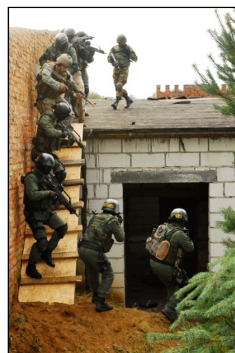
Coalition special operations forces assault a building in search of a mock high-value target in Darwsko, Poland, Sept. 20, 2010, during the opening ceremony for exercise Jackal Stone 2010

Security Sector Assistance – Security assistance encompasses a group of programs through which we provide defense articles and services to international organizations and foreign governments in support of national policies and objectives. To improve the effectiveness of our security assistance, our internal procedures need comprehensive reform. To form better and more effective partnerships, we require more flexible resources, and less cumbersome processes. We seek authorities for a pooled-resources approach to facilitate more complementary efforts